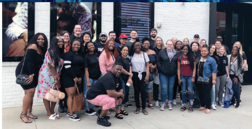
Criminal Justice Student Trip to Birmingham