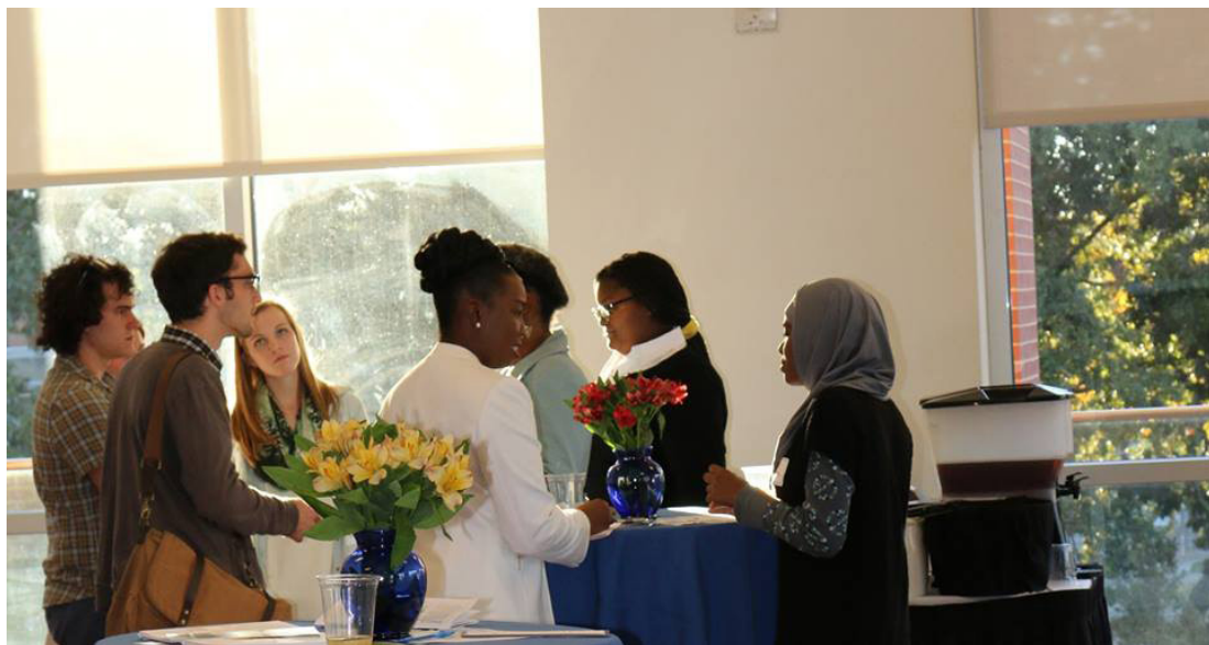
Students and employers networking at the fall fusion event.

In 2000, the University of Memphis joined forces with a cross-section of Memphis nonprofit agencies to form the Nonprofit Leadership Collaborative (NLC), aiming to identify, train and mentor the next generation of nonprofit leadership in our community. The NLC was formed in response to a shortage of qualified, entry-level individuals interested in working in the local nonprofit sector. Through its collective work, the Collaborative has introduced University of Memphis students to cutting edge nonprofit theory and management training, offered them practical nonprofit work experience via internships, and connected them to meaningful community service activities. Through an affiliation with the Nonprofit Leadership Alliance, the Collaborative gives students the opportunity to earn the nationally recognized Certified Nonprofit Professional (CNP) credential. Nearly 150 students have successfully completed the CNP program, and many of these are employed in management and leadership positions within the local nonprofit sector.