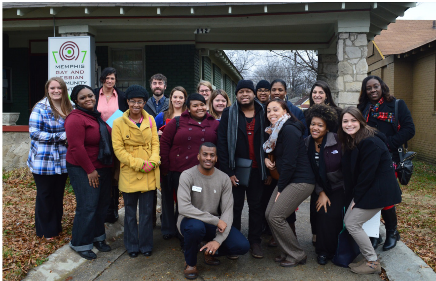
MSW-PDI students at an experiential didactic training

A total of six cohorts will complete MSW-PDI in the three year period, for an anticipated total of approximately 94 trainees. The first cohort of 18 MSW-PDI prepared students completed their training in April 2015, and have since graduated from the MSW program. Outcomes from the initial group indicate significant increases in competence in all six focus areas. The second cohort has been filled and will begin in July 2015.