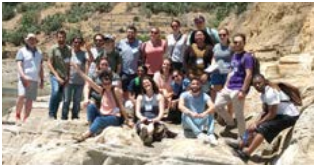
Students at the Simeto River, Sicily