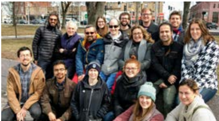
Urban Resilience Students visit Boston

they identified areas of focus in North Memphis that might benefit from a small-scale, low-tech and short-term community project in collaboration with community partners.