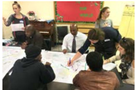
CRP faculty & students facilitate a Memphis 3.0 Workshop

The Department of City and Regional Planning (CRP) and the University of Memphis Design Collaborative (UMDC) , the department's research and outreach center, have been engaged in Memphis 3.0, the city's first comprehensive planning effort since 1981. Students in Land Use Planning, Analysis for Community Planning and Design Collaborative Studio conducted analyses and met with community stakeholders to help residents craft a vision for the future of their neighborhoods. The UMDC will draw on the students' work in the development of district-level plans for the North, Core City, University, Westwood, and Southeast districts. These neighborhood-scale community character plans will build upon citywide vision and goal statements. The department's participation offers students an incredible opportunity to learn from practice while contributing to the development of policies that will guide Memphis into its third century.