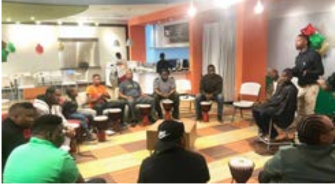
Barbershop Talk: A LIFE circle of care activity