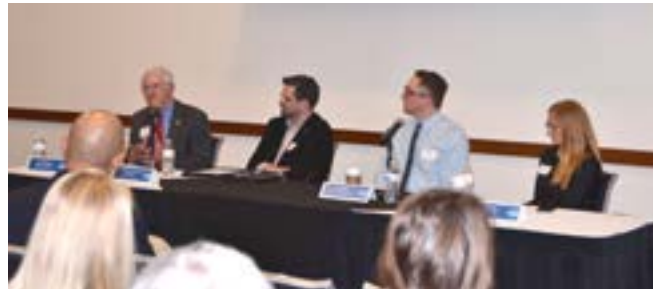
Issues & Opportunities in the Mid-South Panelists