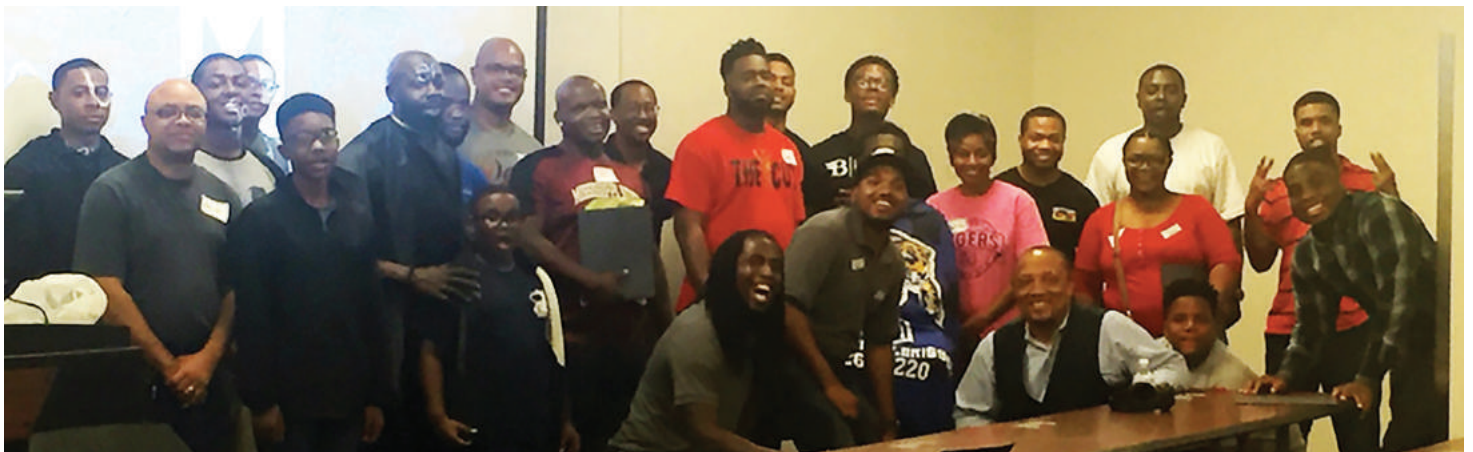
Barber Shop Talks

individual's homelessness. Her work centers on assessing and building tools to enhance the intake process, including identifying what programs and resources are available in the city. Additionally, she is researching trauma informed care to see how this approach might be adapted to improve the intake process.