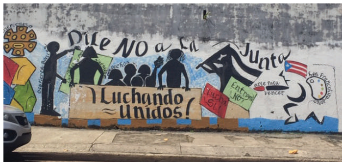
Health and Poverty in Cuba & Puerto Rico