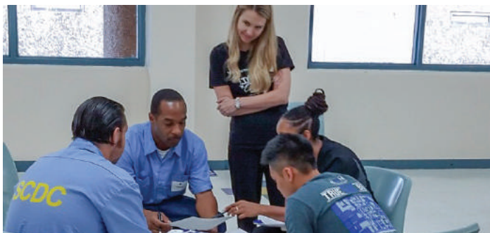
Criminal Justice Inside Out Class