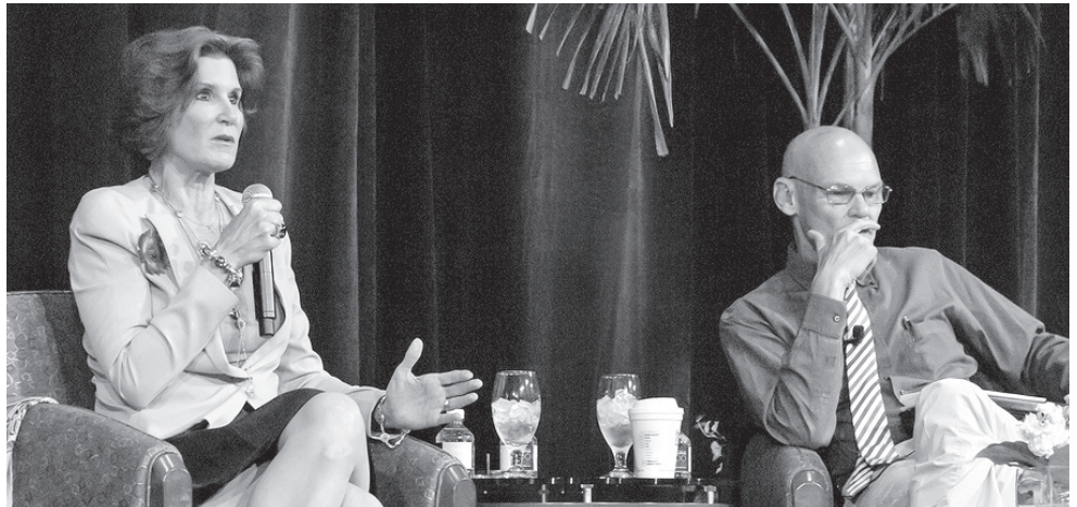
Mary Matalin and James Carville entertained a large crowd at a luncheon on campus.

On September 14, 2012 the University of Memphis held a Centennial Celebration Luncheon with noted political strategists James Carville and Mary Matalin. Several of our honors students were invited to the luncheon. Later that afternoon, James Carville met with our students for a Question and Answer Forum. They discussed issues ranging from U.S. Foreign Policy to the 2012 presidential campaign.