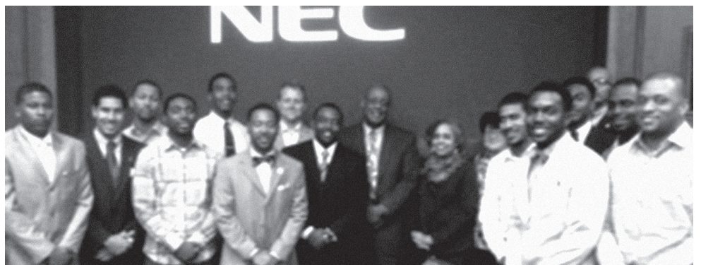
Kappa Alpha Psi held a Political Symposium in October 2012.

On October 3rd, 2012 the Political Science Department and our political science honors society Pi Sigma Alpha sponsored a Presidential Debate Watch Event in the Rose Theater. Students from four Tennessee universities were linked via satellite to watch and discuss the debate between President Obama and Governor Romney. About 200 University of Memphis students attended. Using cell phones or laptops, they were able to participate in polling on various political questions before and after the debate. Our students developed the polling questions and helped with organizing the event. CNN as well as local media covered the event, and CNN interviewed students on the Tennessee voter ID law.