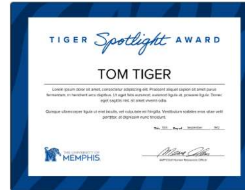
A Job Well Done