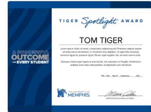
Successful Outcome for Every Student