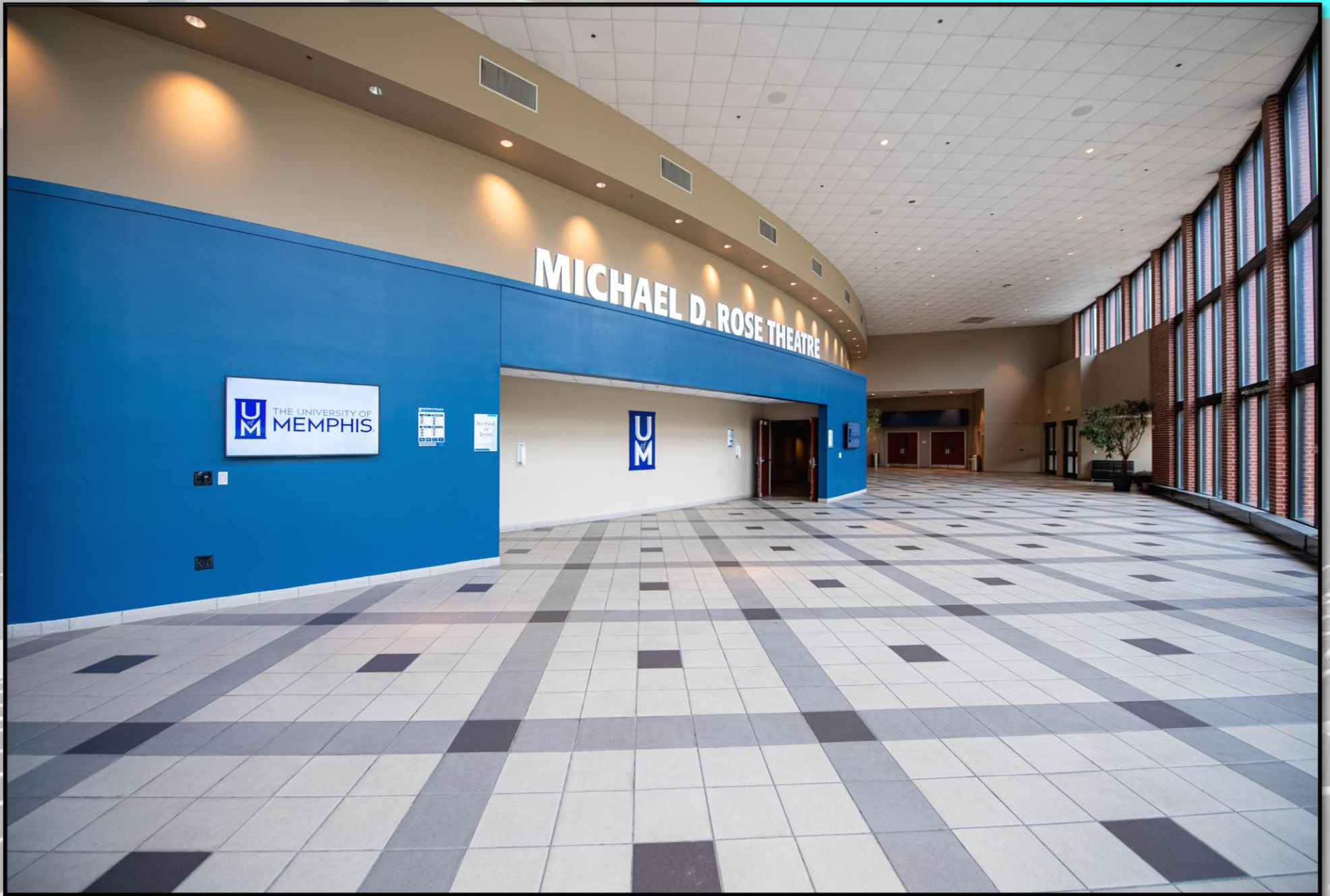
Main Lobby | View to South Lobby