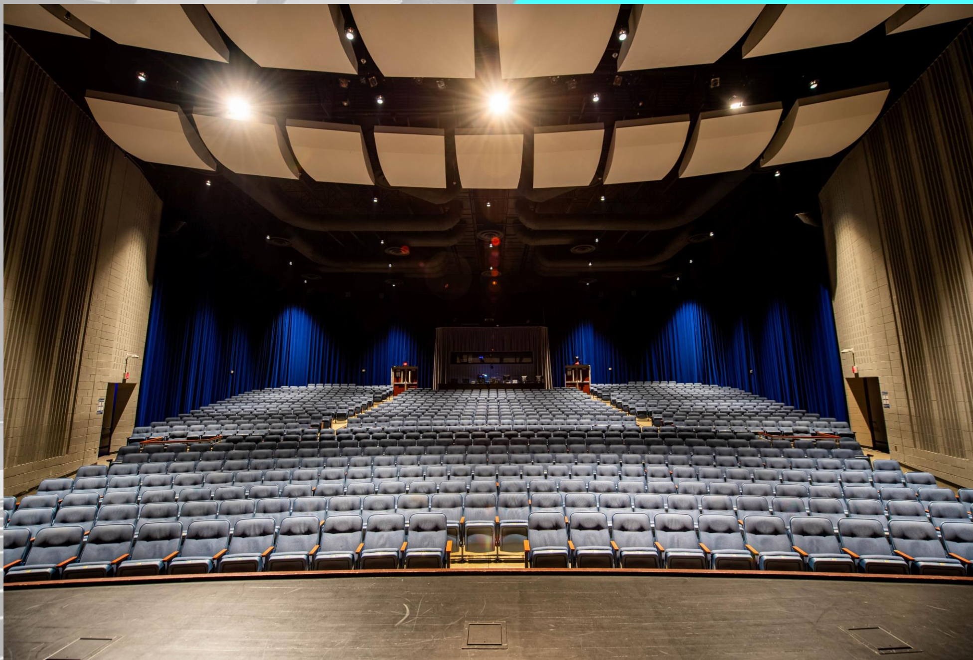
View From Main Stage | Seating Capacity 921