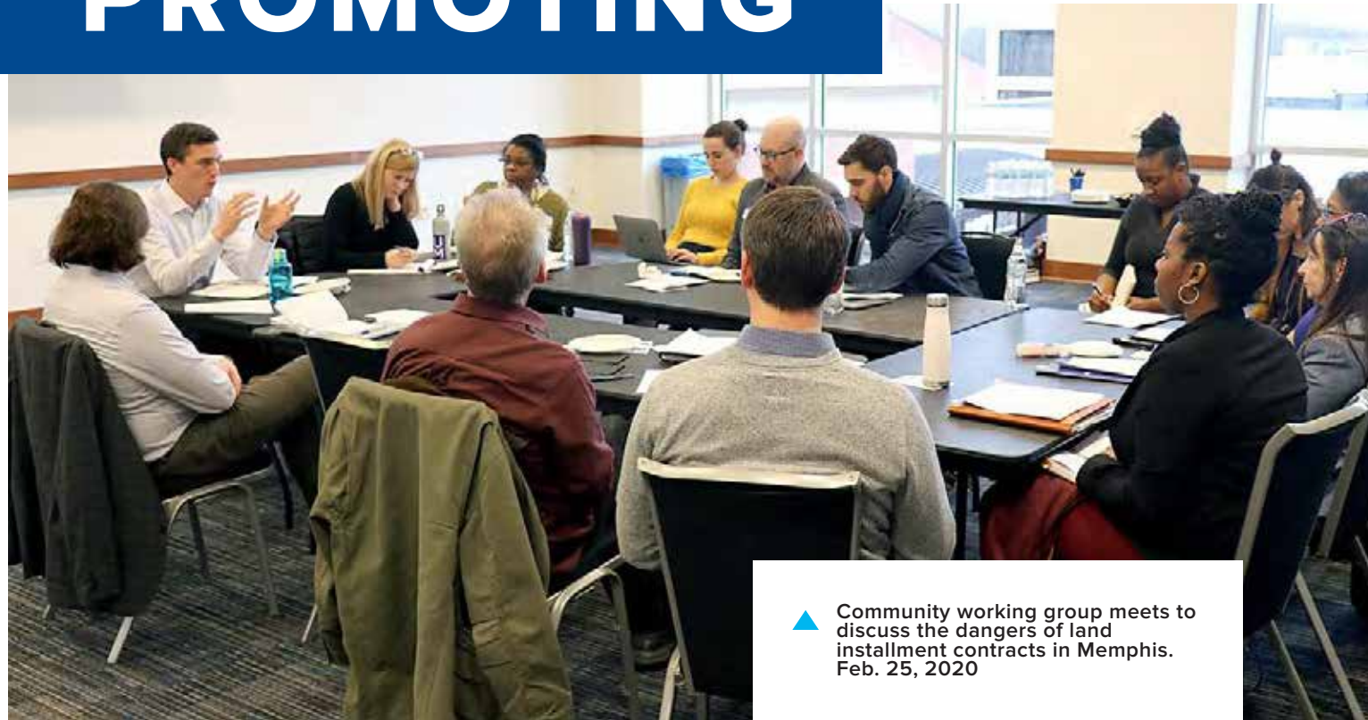
▲ Community working group meets to discuss the dangers of land installment contracts in Memphis. Feb. 25, 2020