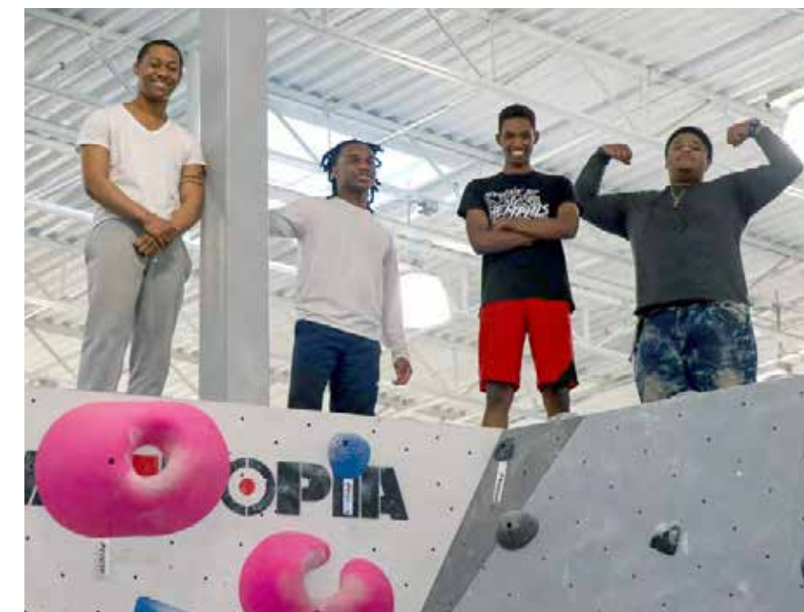
▲ HAAMI members and staff visit Memphis Rox for a HAAMI team building outing. Feb. 28, 2020