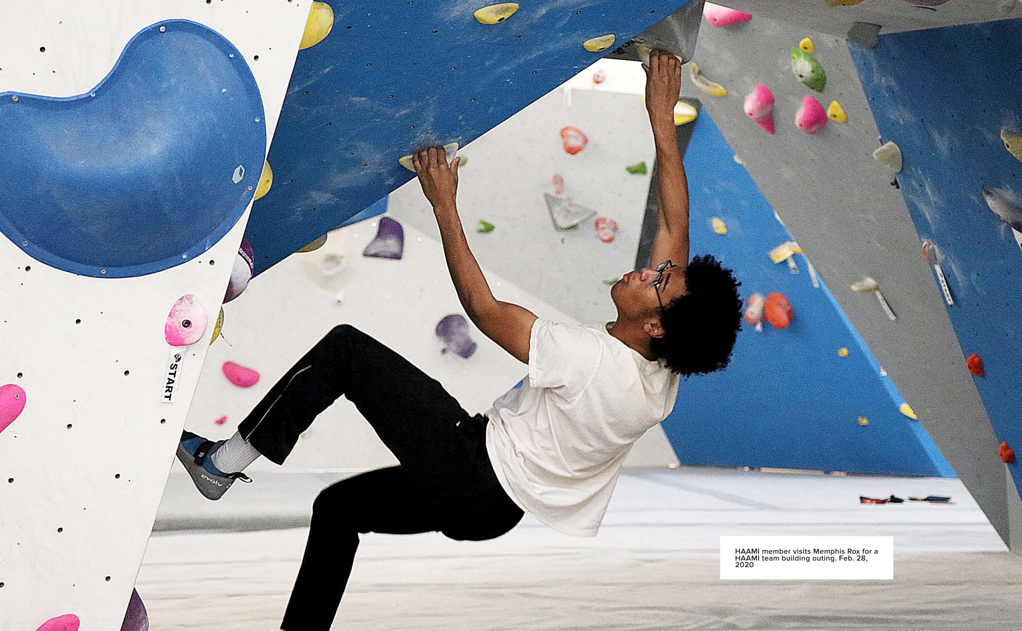
HAAMI member visits Memphis Rox for a HAAMI team building outing. Feb. 28, 2020