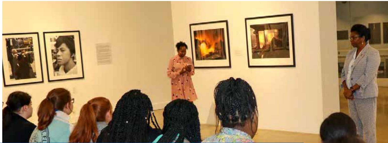
EXHIBIT AND CLOSING LECTURE