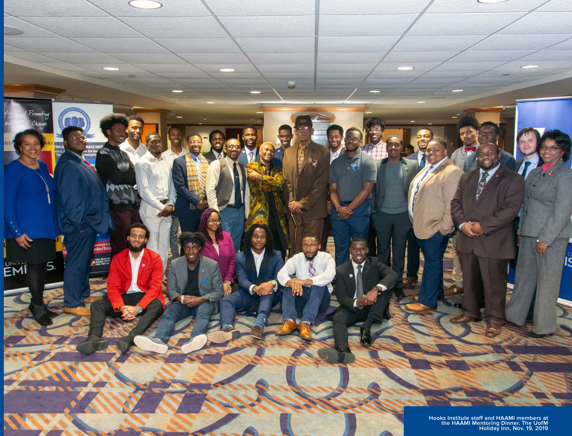
Hooks Institute staff and HAAMI members at the HAAMI Mentoring Dinner. The UofM Holiday Inn, Nov. 19, 2019

The Hooks Institute's goal is to promote its mission by ameliorating racial, economic and social disparities in Memphis and the Mid-South by using the collective scholarship and resources of the university community.