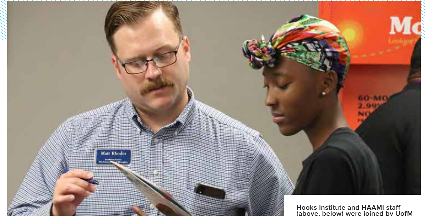
Hooks Institute and HAAMI staff (above, below) were joined by UofM colleagues to instruct HAAMI and fellow UofM students on personal finance. Oct. 24, 2019.