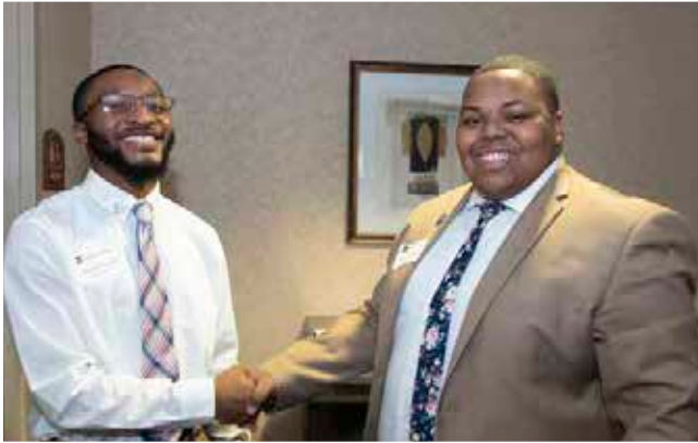
HAAMI members, UofM faculty, Hooks staff and community leaders at the annual HAAMI mentoring dinner. Nov. 19, 2019