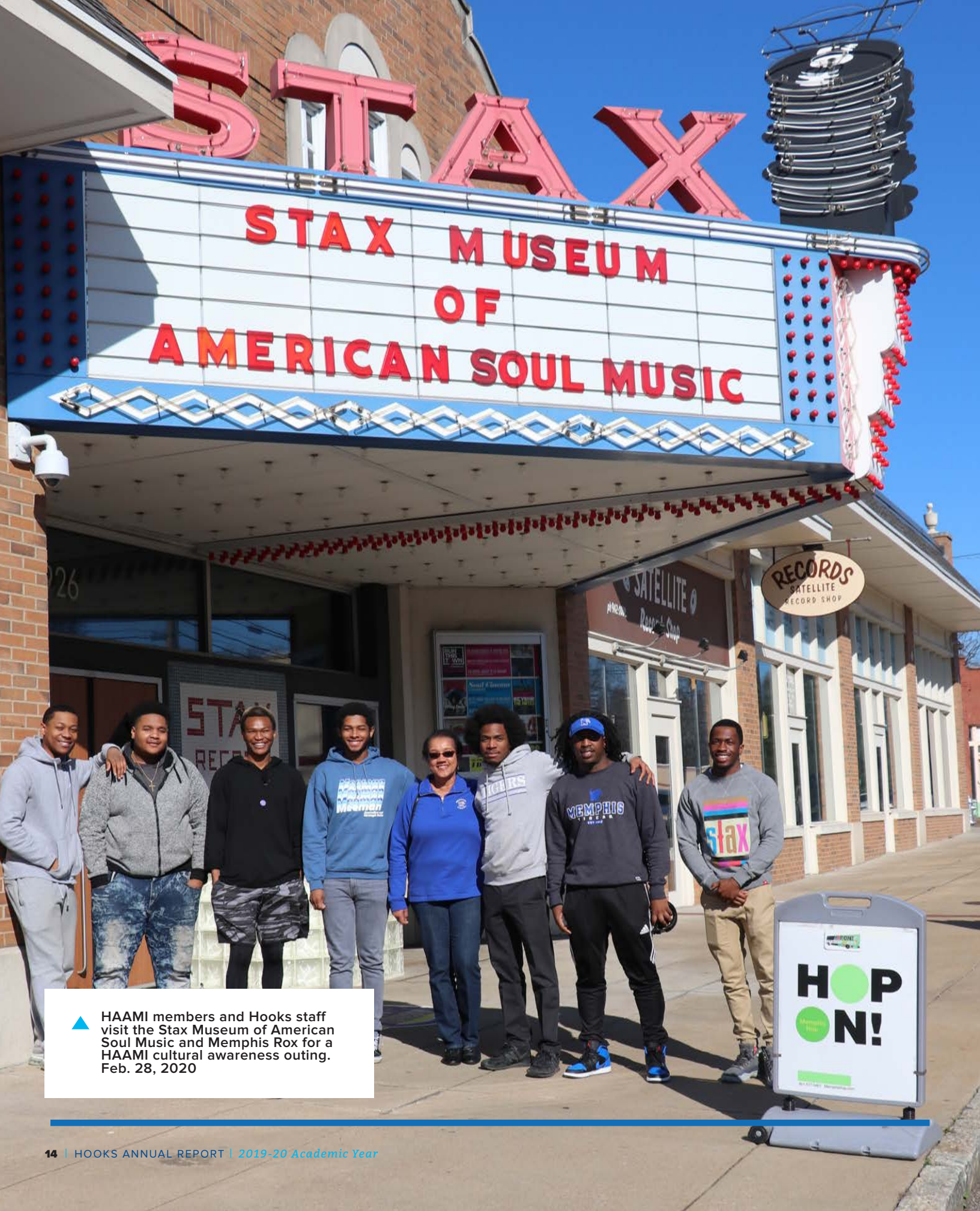
▲ HAAMI members and Hooks staff visit the Stax Museum of American Soul Music and Memphis Rox for a HAAMI cultural awareness outing. Feb. 28, 2020