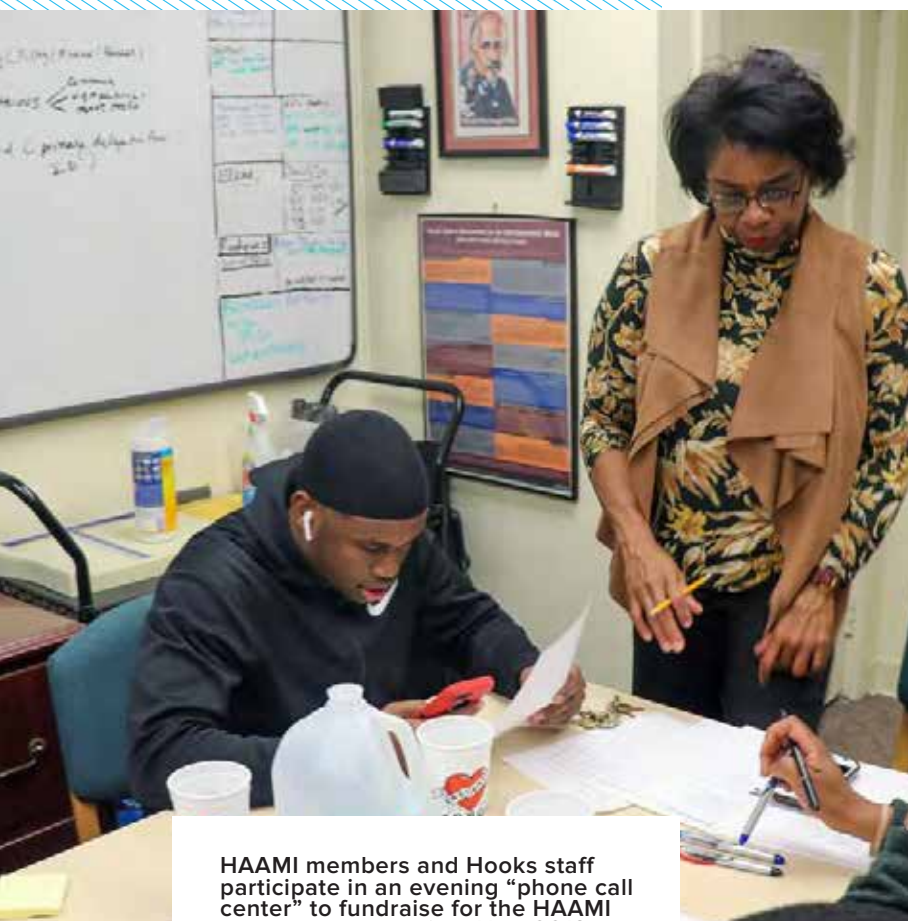
HAAMI members and Hooks staff participate in an evening "phone call center" to fundraise for the HAAMI momentum campaign. Nov. 2019