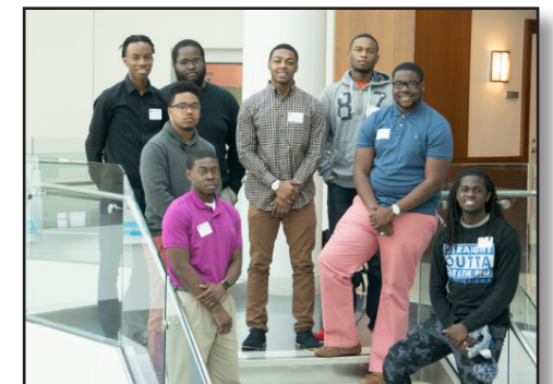
HAAMI members at monthly session.

For more about HAAMI, contact Rorie Trammel at rtrammel@memphis.edu or 901-678-4654, or visit www.memphis.edu/benhooks/haami .