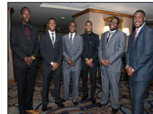
HAAMI members celebrate a successful year at the 2017 Hooks Gala, April 20, 2017.

HARNESSING THE POWER OF TALENT: AFRICAN-AMERICAN MALE STUDENTS